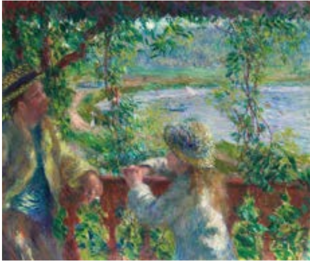
Near the Lake, Pierre-Auguste Renoir, 1879-1880