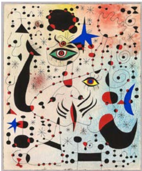
Ciphers and Constellations in Love with a Woman, Joan Miro, 1941