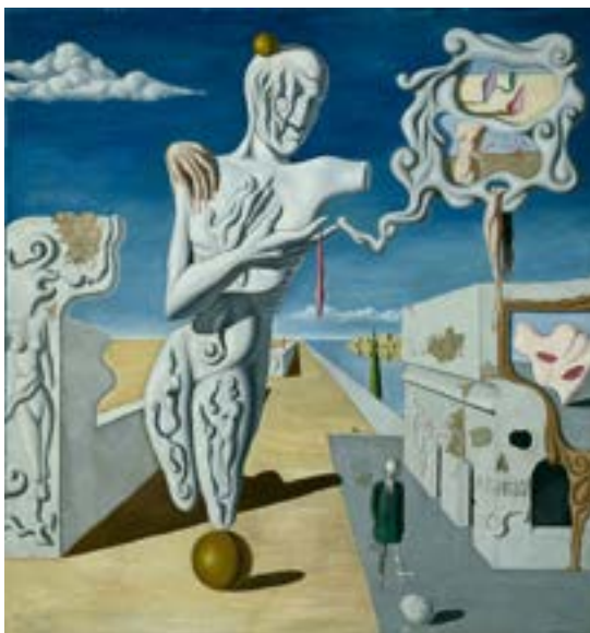
Midday Sorrow, Angels Planells, 1932