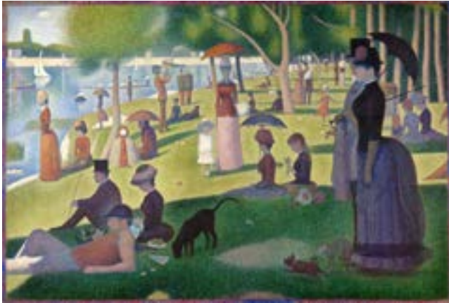
A Sunday on La Grande Jatte, Georges Seurat, 1884-1886