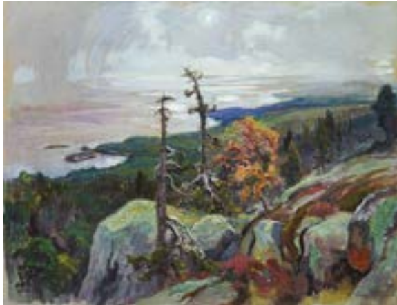
View from Koli, Eero Järnefelt, 1920s