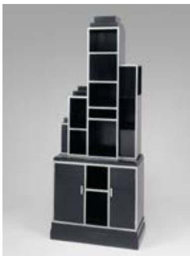
Skyscraper Cabinet, Paul Theodore Frank, 1927