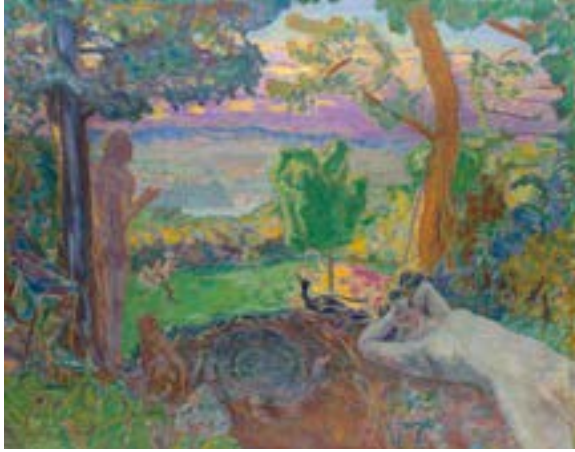
Earthly Paradise, Pierre Bonnard, 1916-1920