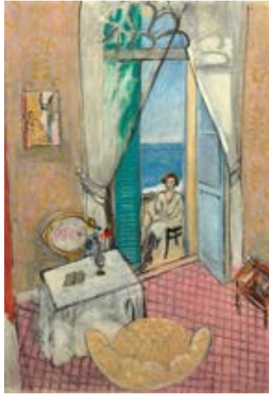
Interior at Nice, Henri Matisse, 1919-1920