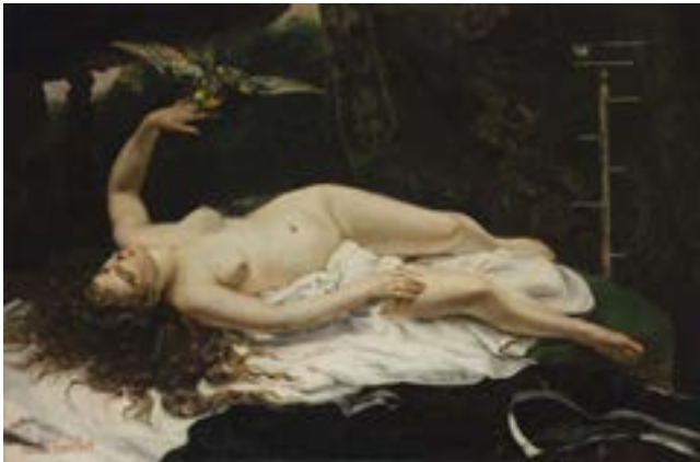
The Lady With the Parrot, Gustave Courbet, 1866