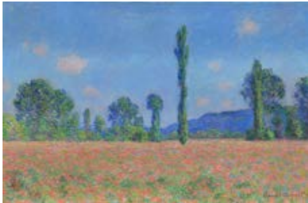
Poppy Field, Claude Monet, 1890-1891