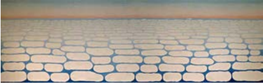
Sky Above the Clouds IV, Georgia O'Keeffe, 1965