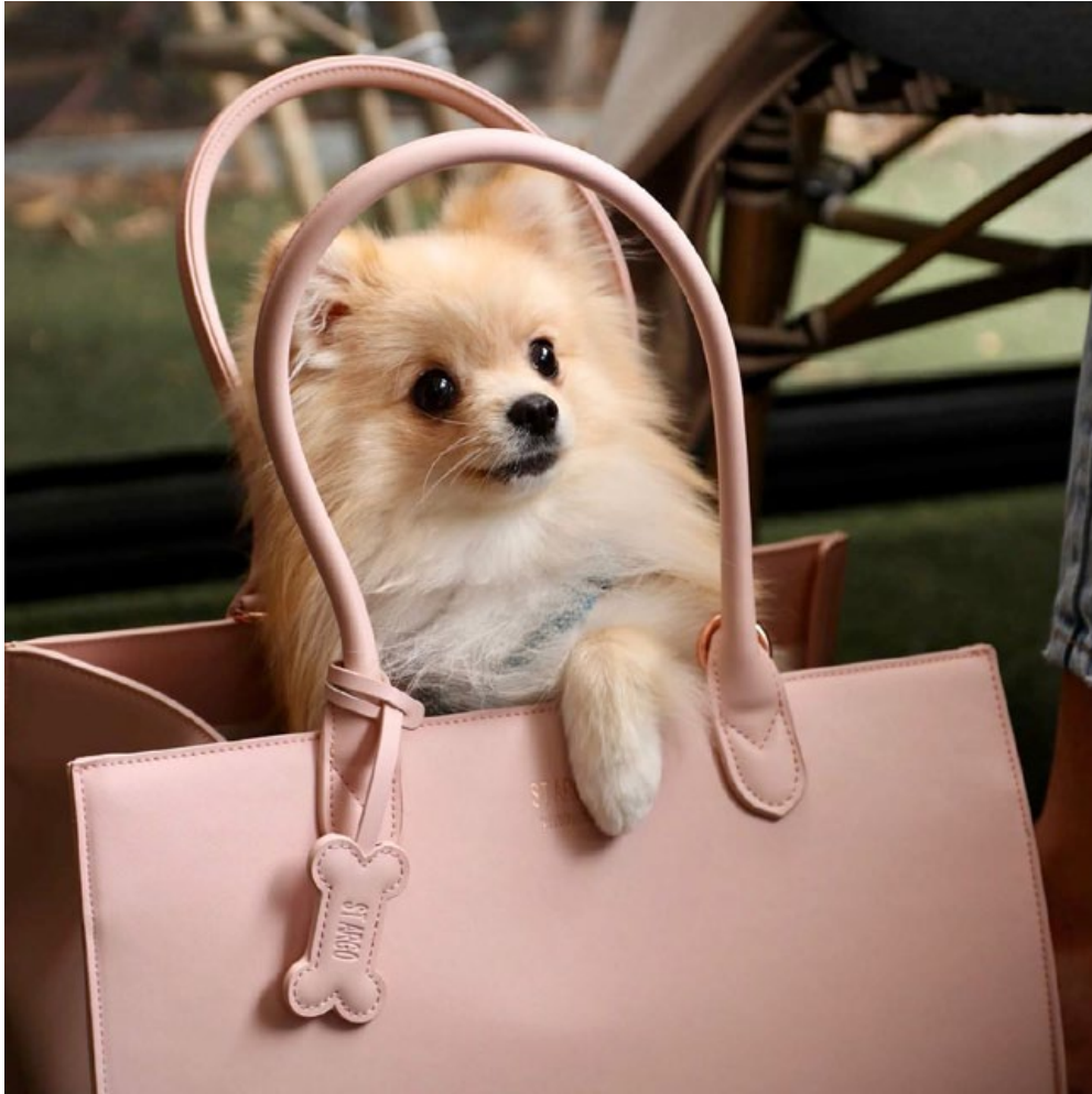
THE LANGHAM PET CARRIER $199