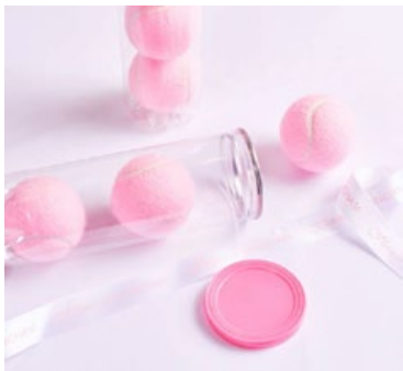
THE LANGHAM PET TENNIS BALLS $15 3 PACK