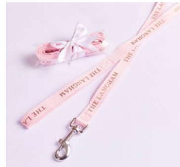
THE LANGHAM PET LEASH $30