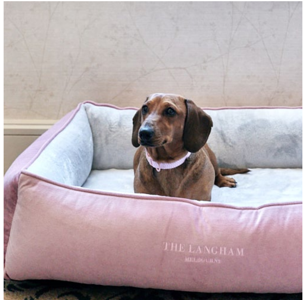
THE LANGHAM PET BED $179 SML $209 LRG