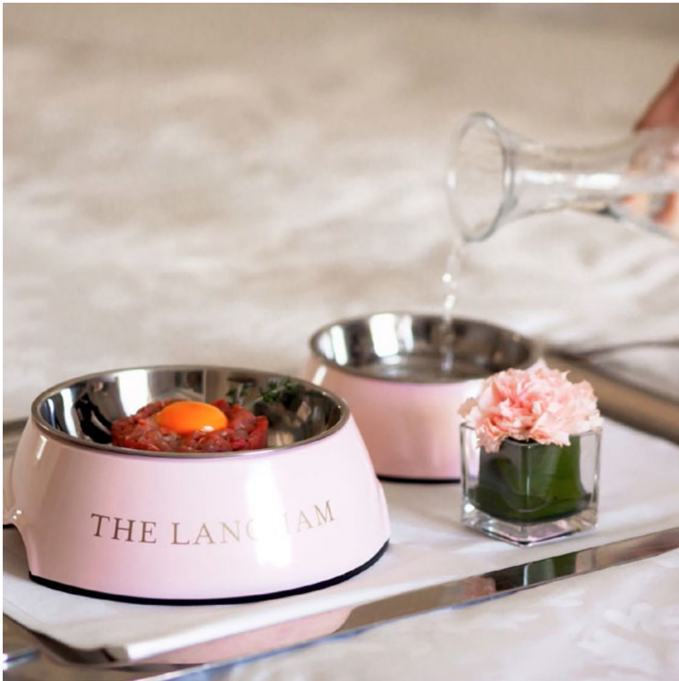
THE LANGHAM PET BOWL $30 SML $40 LRG