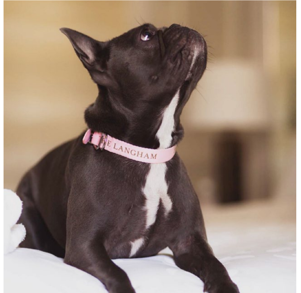
THE LANGHAM PET COLLAR $15 SML $15 LRG