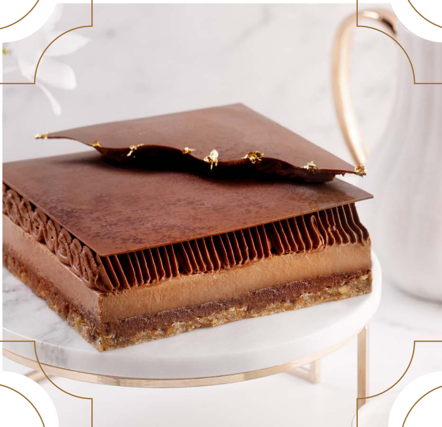
HAZELNUT DACQUOISE CAKE