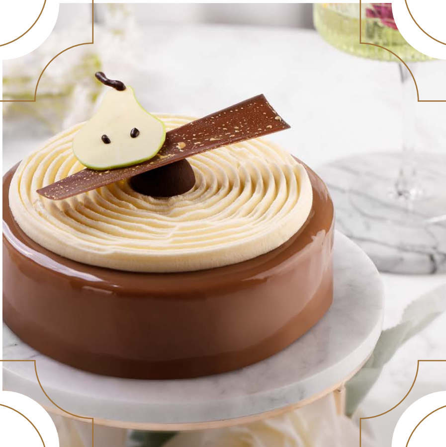
EARL GREY AND PEAR CHOCOLATE MOUSSE CAKE