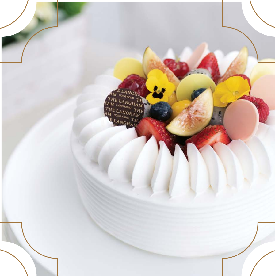
LANGHAM FRUIT CREAM CAKE