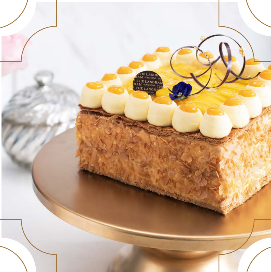
MANGO / STRAWBERRY MILLE-FEUILLE