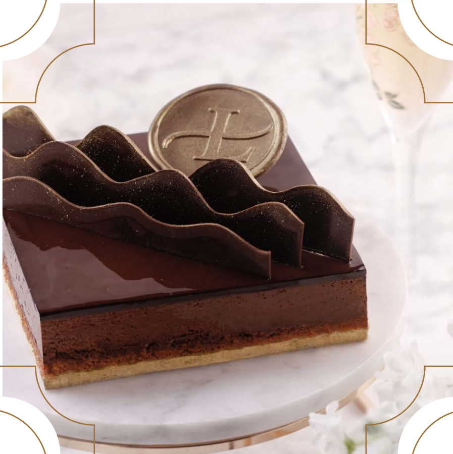
DARK CHOCOLATE CRUNCHY CAKE